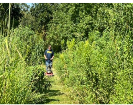
Kirk Calbert (Staff) mows meadow paths