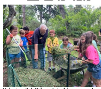
bin with Sprouts summer campers.