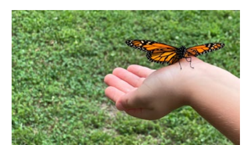
Backyard Habitat summer campers release butterflies wi Volunteer and monarch-whisperer, Cathy Griffin.