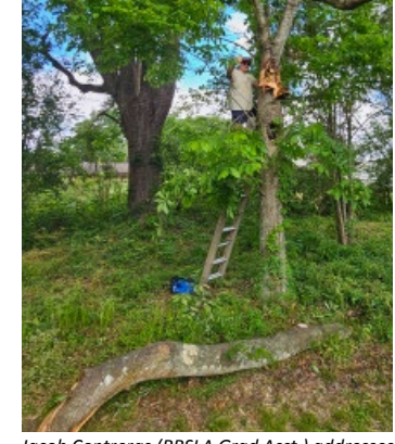
ummer Jacob Contreras (RRSLA Grad Asst.) addresses mpers. spring storm damage.