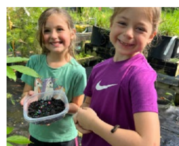
Sprouts summer campers enjoy a lesson on insects in the Hilltop Nursery.