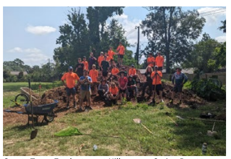
Scouts Troop 7 volunteer at Hilltop on a Spring Day to mulch 65 trees in the Woodland Walk.