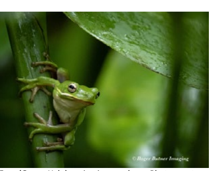
Frog (Genus Hyla) posing in superhero.

There is a great spirit as always at Hilltop, and the many plants and critters seem to agree. Life is singing as the past summer's droughts have been alleviated. The ravine has only been dry a few days. Thankfully the frogs are back! There are gulf coast toads in every puddle. Tree frogs of the genus Hyla are posing like superheroes. And a new one for me, the terrestrial frog, known as a sheep frog screams away from just beneath the ground. Each of these species interplays with the site, and during Hilltop's moth sheetings, raccoon visitors are commonly seen feeding on the frogs! Another night time observation is the grasshopper and spider. As the spider population grows, the grasshopper daytime activity all but ceases, and they shift to feeding on the meadow at night. Come see what you can observe at Hilltop! - Will Reinhardt