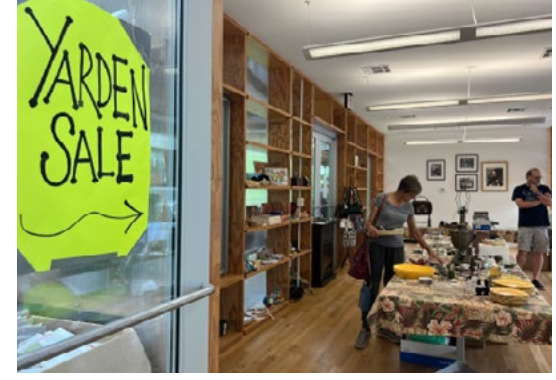
Spring Fling Yarden Sale in the Hillton Arboretum Library