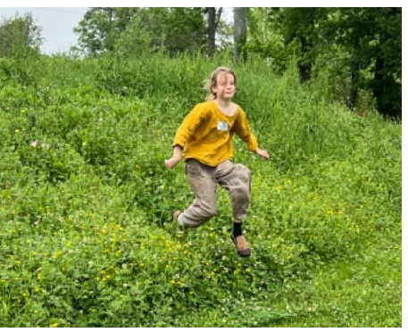
An Easter camper enjoys Hilltop's amphitheater terrain.