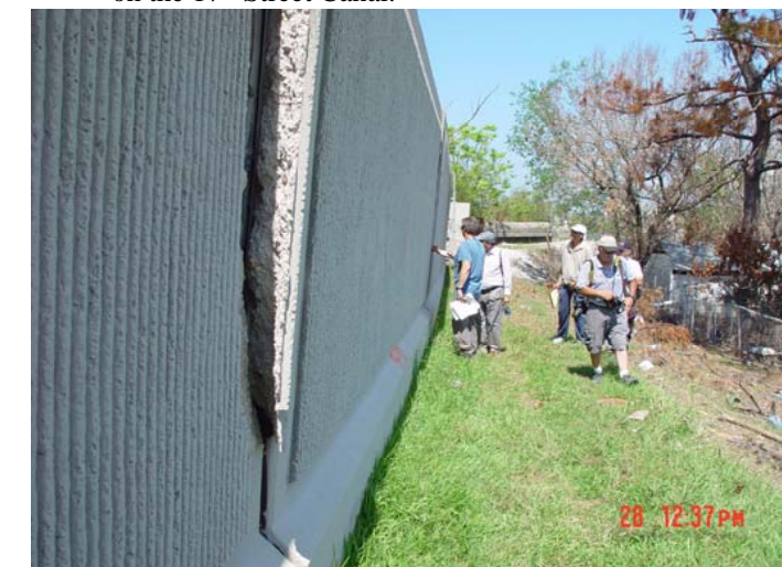
Figure 5: Joint of concrete cap over-stressed and about failure.