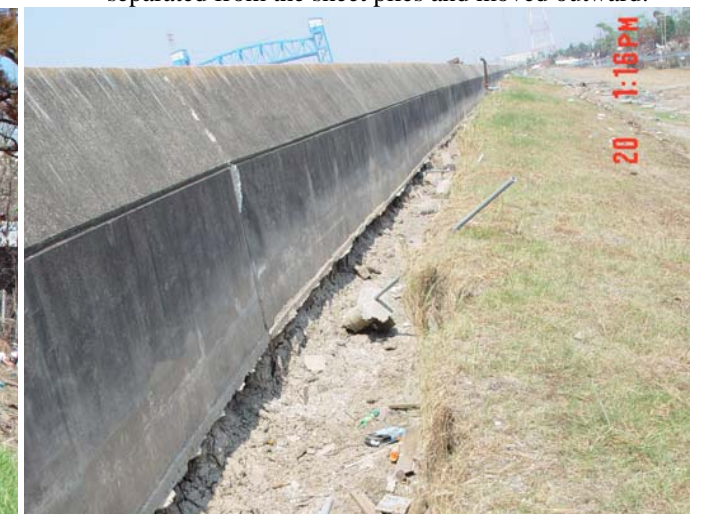
Figure 6: Scour resulting from overtopping.