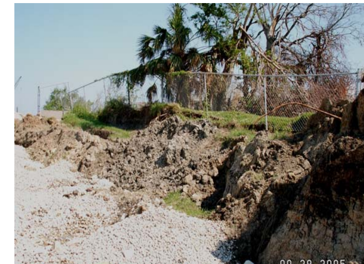
Fig. 3: Lateral sliding of the levee system and the earth next to it on the 17 th Street Canal.

Numerous breaches of the levee system in New Orleans occurred in the wake of Hurricanes Katrina and Rita. It seems that most failures were complex caused by a number of processes including failure of foundation soils and earthen levee embankments as well as overtopping which occurred in the event of the storm surge rising over the tops of the levees. The overtopping produced erosion/scour that subsequently led to failures and breaches. In some cases a particular mechanism might have been a major failure mode whereas in other cases a combination of mechanism could be responsible. The failure mechanism illustrated here are based on field work, but should not be treated as final as more detailed analyses and field data are required. The failure mechanisms are illustrated in the following Figures with the aid of pictures from the failure sites.