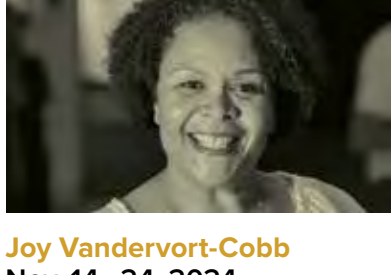
Nov. 14-24, 2024 Reilly Theatre